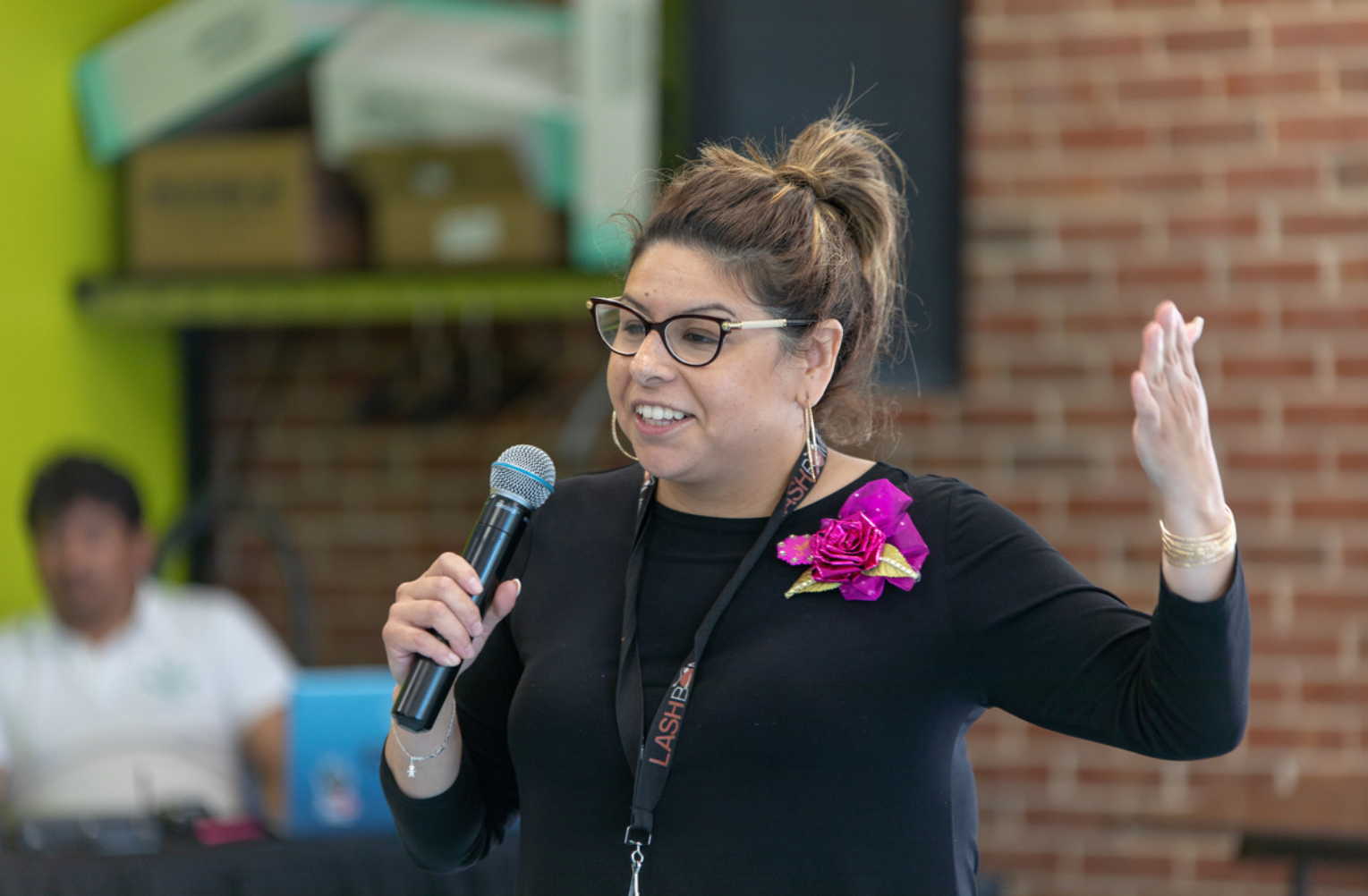
Mother's Day Events at CHA Buildings